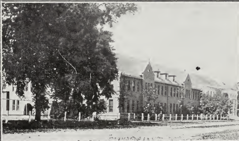
Buildings of the Colorado Agricultural College.

Top, Conservatory of Music; Center, Civil and Irrigation Engineering; Lower, Mechanical Engineering.