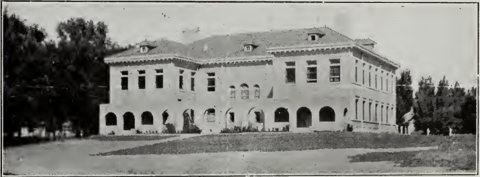
Guggenheim Hall, Colo. Agricultural College.

The new Sigma Phi Epsilons have entered into the spirit of the fraternity with a vim and each is putting forth all his efforts to come up to the standard set for them as members of the best Greek organization in the college world.