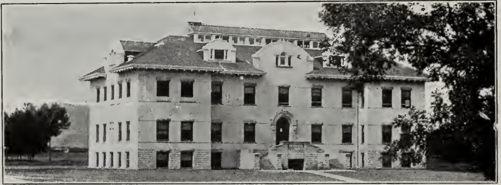
Civil and Irrigation Engineering Building, Colorado Agricultural College.

This has been an eventful year at the Colorado Agricultural College and the men of Colorado Gamma Chapter have done their share in making it so. For the first time in history the Aggies carried off the football championship, defeating every other team in the conference by a most decisive score. Only in three games were the Farmers scored upon and during the season ran up a total of 241 points to their opponents 31. Three Sigma Phi Epsi-