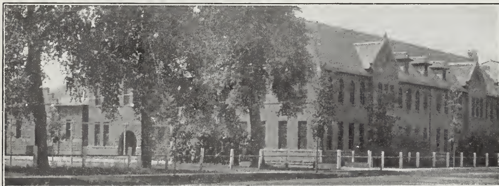
Mechanical Engineering Building, Colorado Agricultural College.