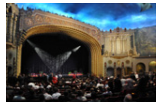
Conclave 2011 Phoenix – Balanced Man Celebration with Muhammad Ali