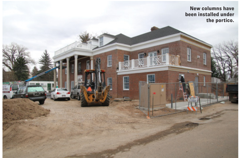
New columns have been installed under the portico.

On the inside of the house we are working on the last of the finishes. Final trim, paint, door and hardware installation, wall tile, flooring, and trim out of all electrical, plumbing, and HVAC have been installed. All the new kitchen equipment is being installed.