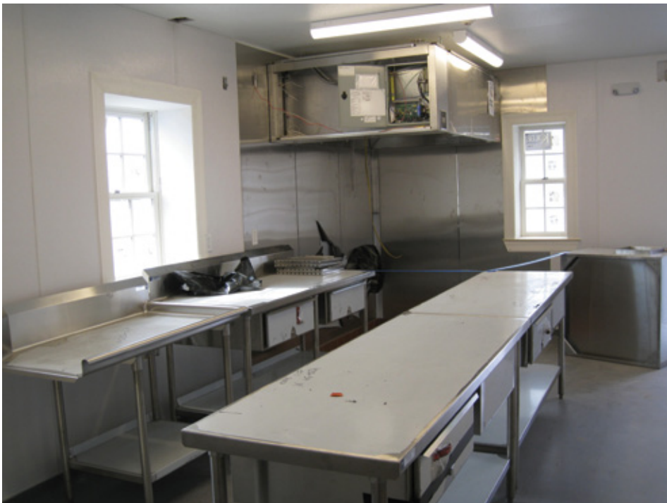
Kitchen is nearing completion.