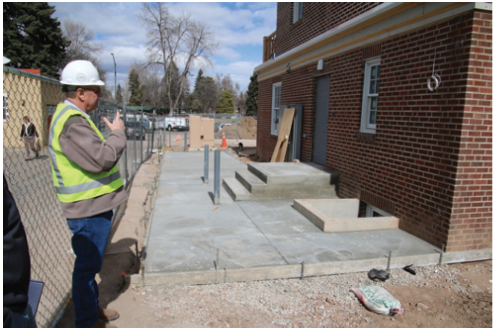
The new alley entry and parking is in place.

With construction coming to an end soon we are entering the final months of the capital campaign. It's important we reach our goal of $1.25M, so that the board does not have to exercise its option for additional financing. We need to raise another $82,000. The board is asking if you have