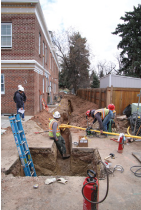
A new 2" gas line had to be installed.

Our General Contractor, Dohn Construction, has done a great job and has been able to accommodate all the constructability issues that arose during construction. They are delivering on time, on budget and with the highest quality.