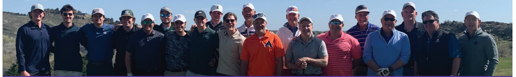
SigEp brothers gather for the Colorado Gamma Challenge Cup.