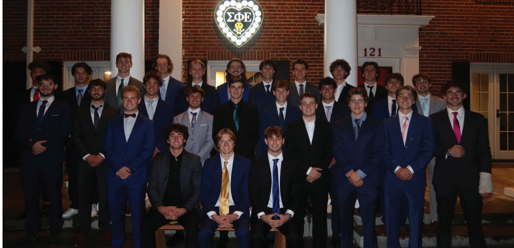
Our fall recruitment class gathers outside 121 following their first formal chapter since initiation.